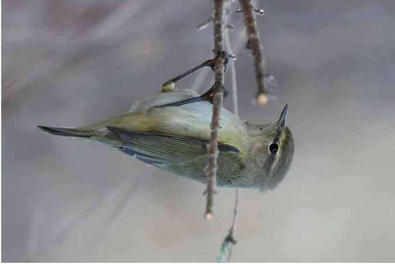
Mosquitero común. Phylloscopus collybita