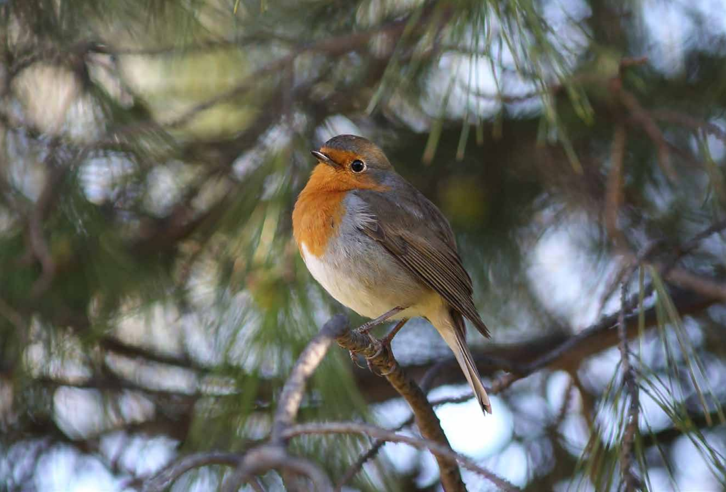
Petirrojo europeo. Erithacus rubecula