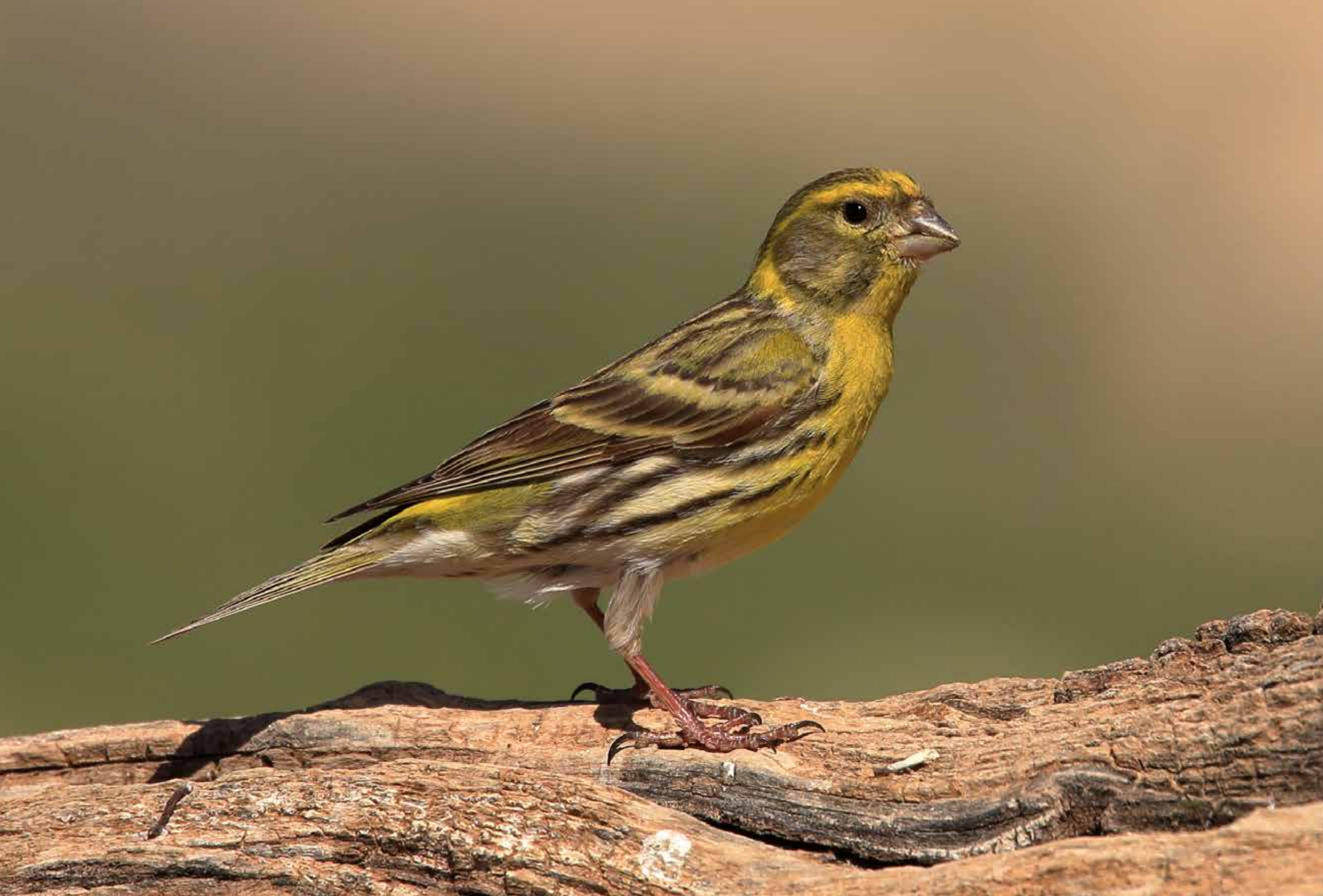
Serín verdecillo. Serinus serinus