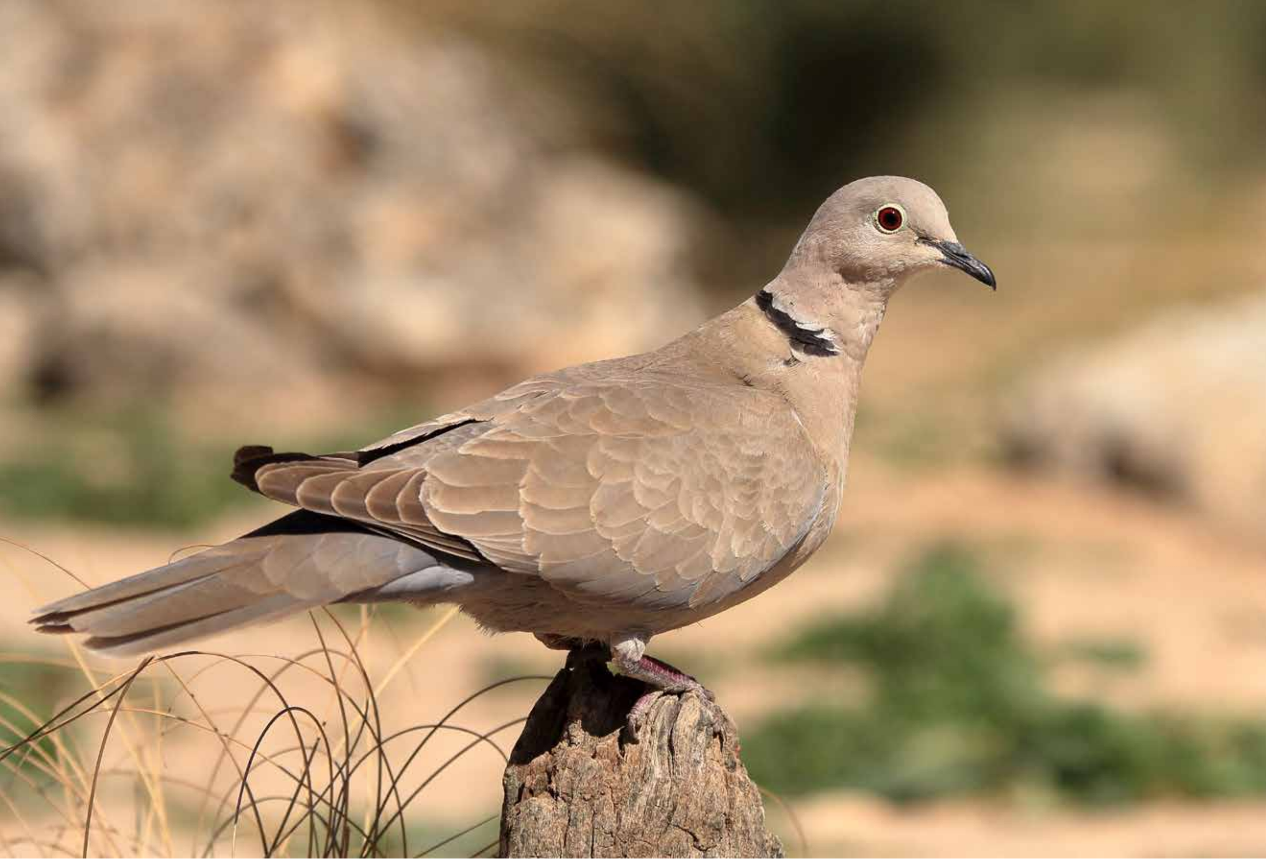
Tórtola turca. Streptopelia decaocto