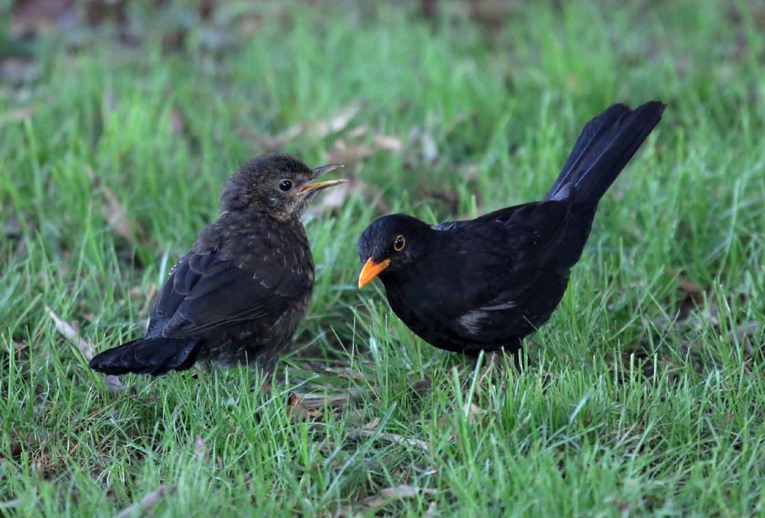
Mirlo común. Turdus merula