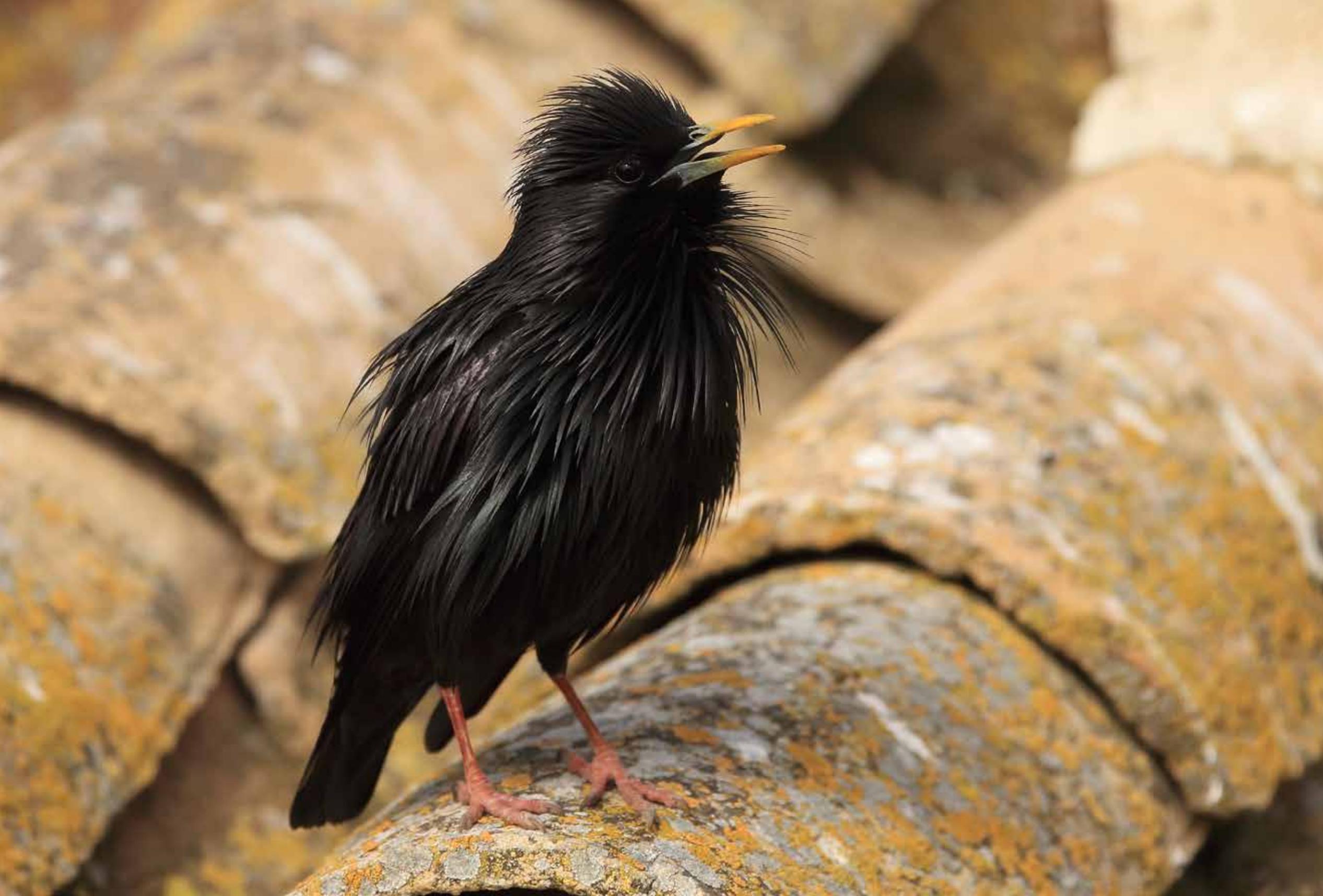
Estornino negro. Sturnus unicolor