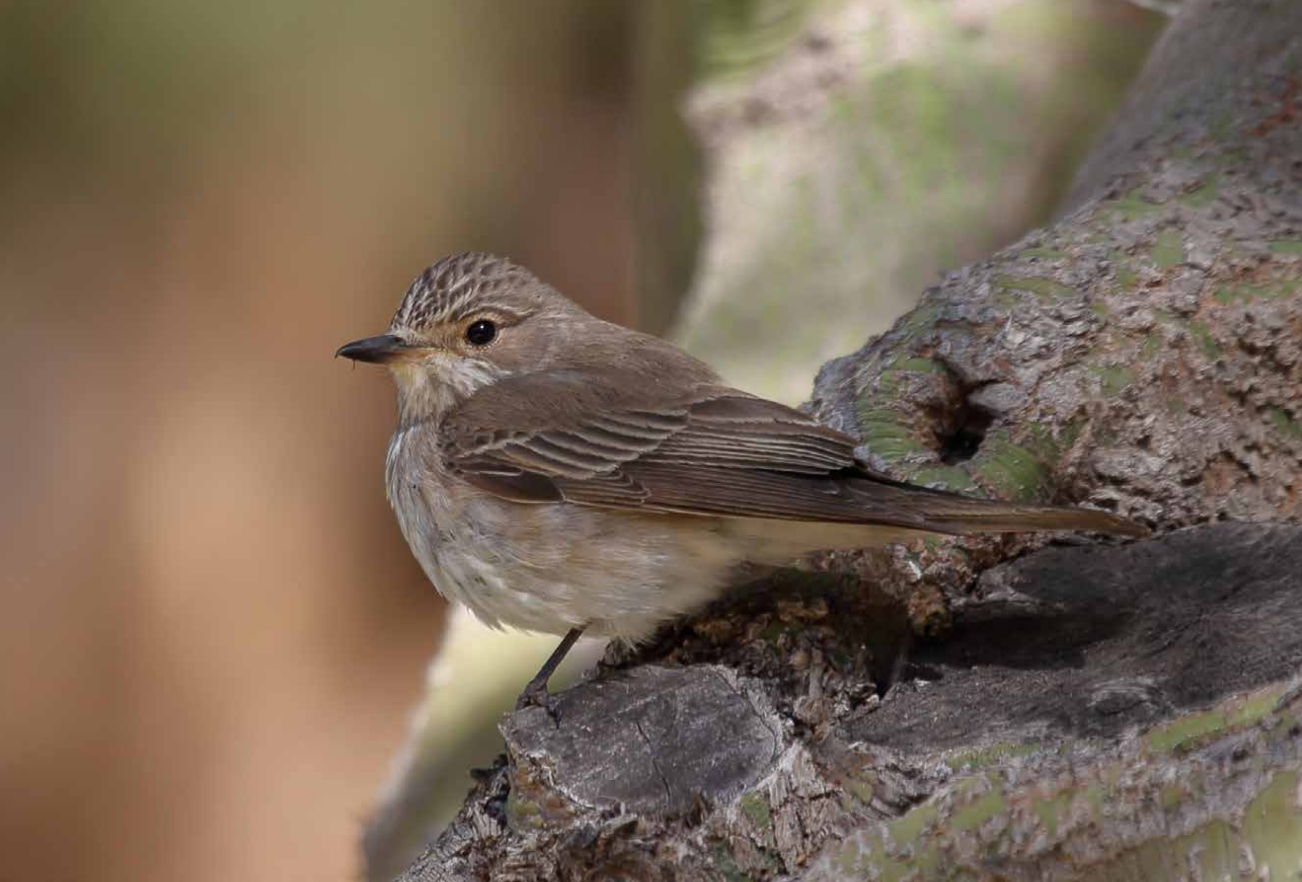
Papamoscas gris. Muscicapa striata