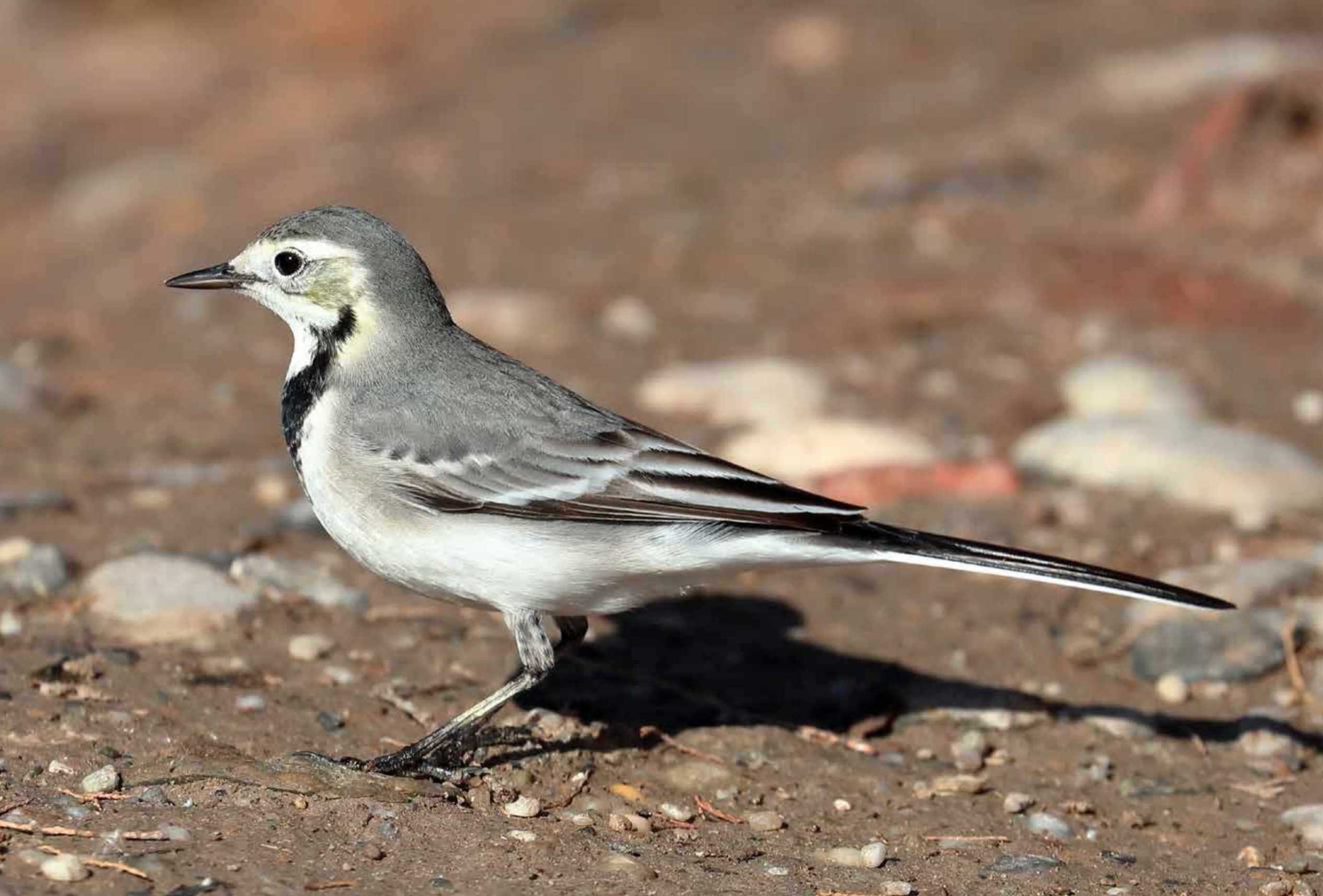
Lavandera blanca. Motacilla alba