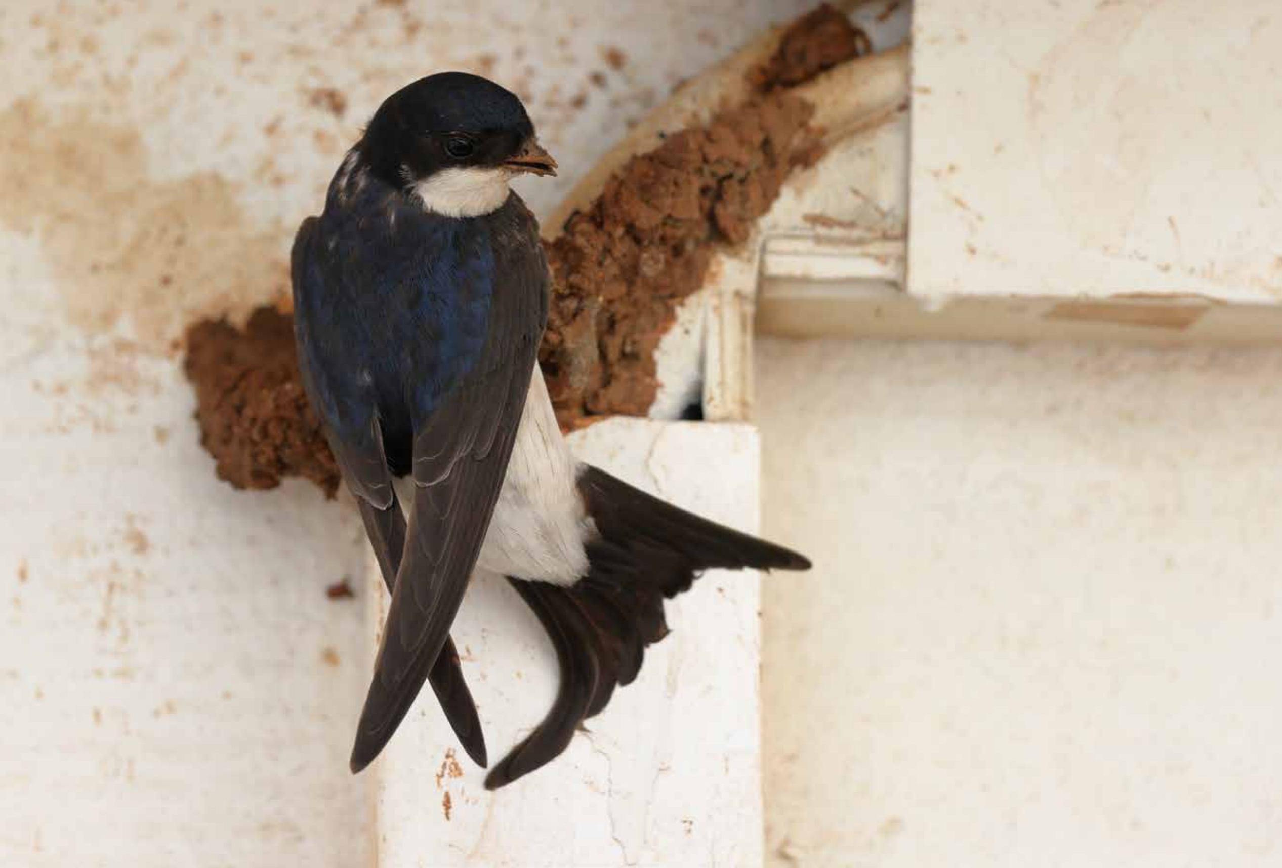
Avión común. Delichon urbicum