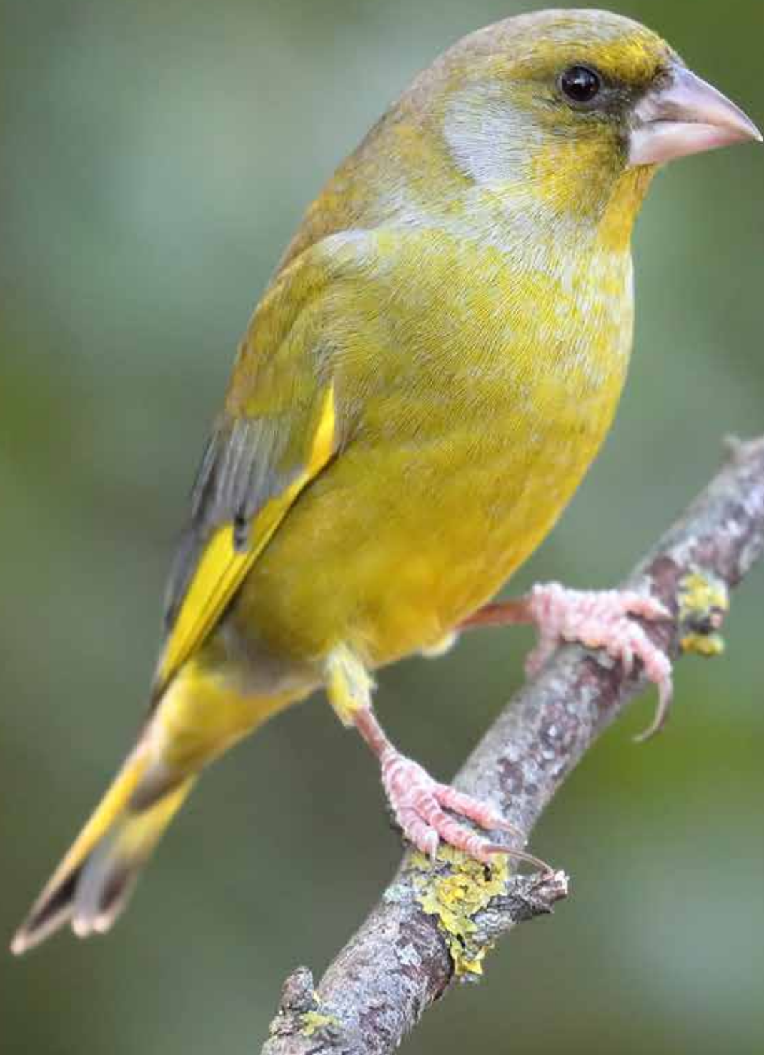
Verderón común. Chloris chloris