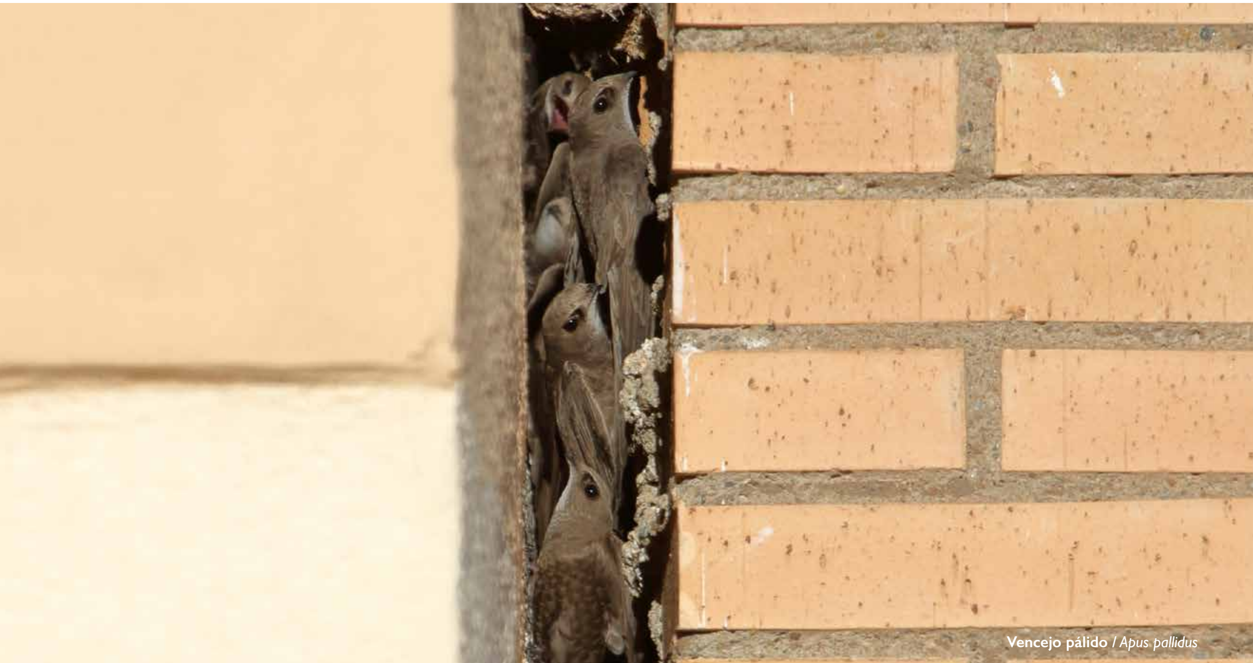
Vencejo pálido / Apus pallidus