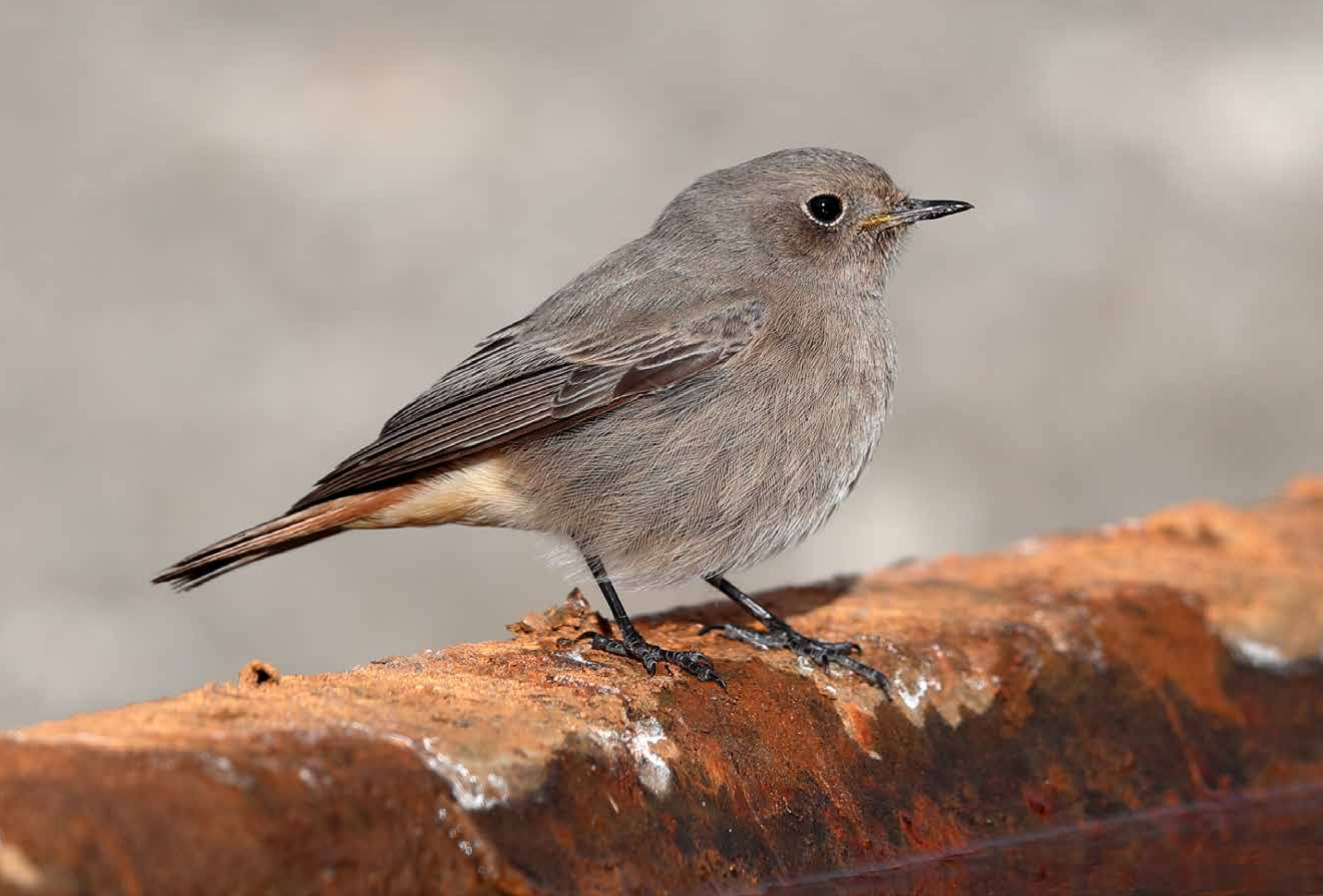
Colirrojo tizón. Phoenicurus ochruros