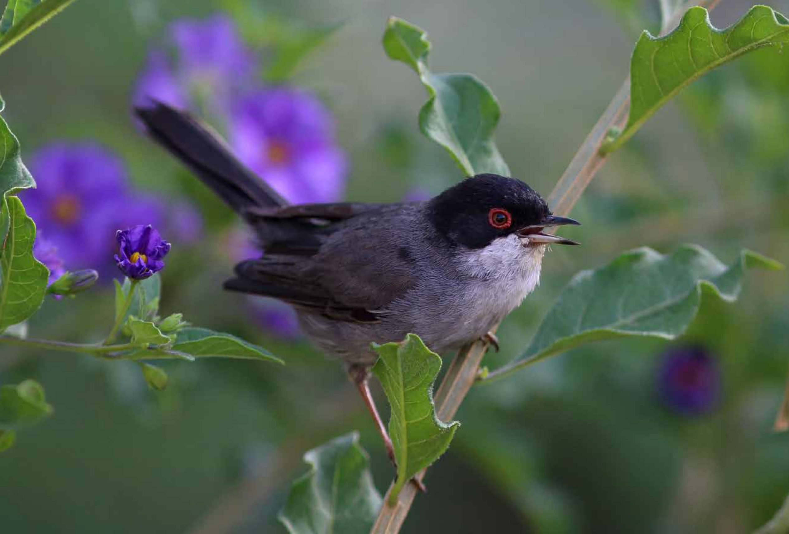
Curruca cabecinegra. Sylvia melanocephala