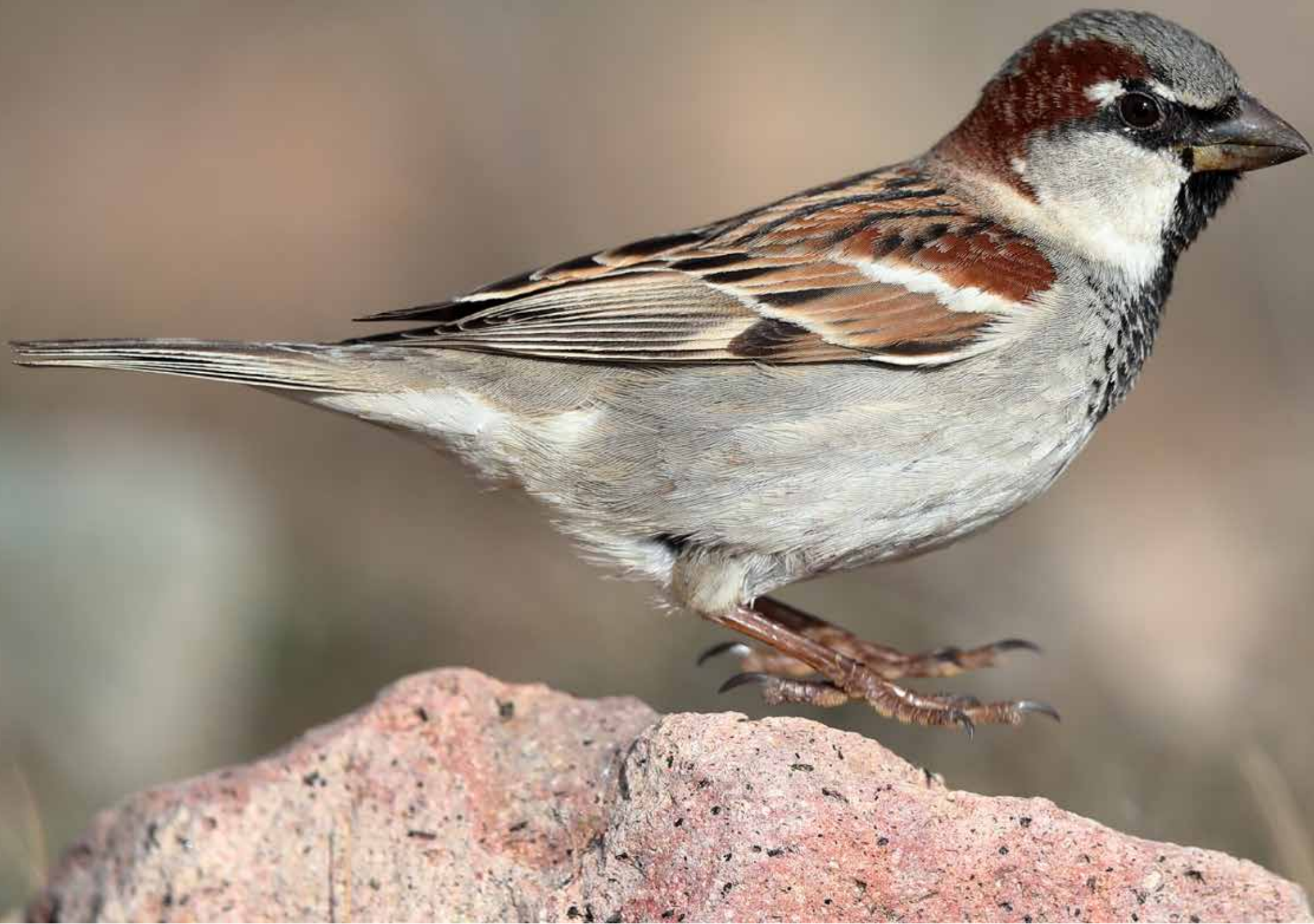
Gorrión común. Passer domesticus